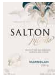
Intenso Marselan 2012 #81546 | Six Pack | $68

Intense purple color with aromas of berries, plums, mushroom, black pepper and other spices. Its tannins are remarkable with good permanence of flavors.