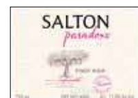
Paradoxo Pinot Noir 2013 #81811 | Six Pack | $72

Moscato blended with a small amount of Gewurztraminer and Malvasia. A combination of expressive and pleasant aromas of flowers (rose, geranium, carnation, jasmine) and fruit (peach, pineapple, apricot, banana).